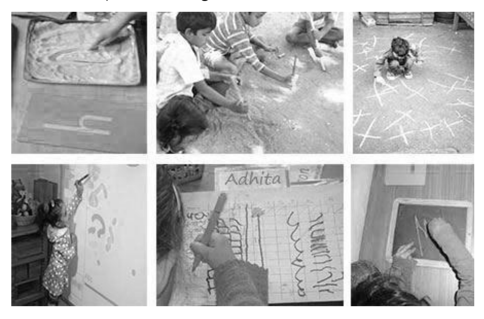
Figure 2 Examples of where students can write: in sand with fingers; outside with sticks; on the pavement with chalk; on the wall with paint; on recycled paper with pens; and on boards with chalk.

Look at Figure 2. Which of the activities would be possible to do with your students in your classroom and school? Discuss this with a fellow teacher if possible. Think of the spaces in your classroom, and outside your classroom, where students could practise writing.