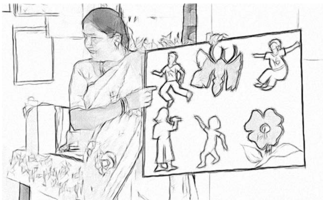
Figure 2 Using pictures to tell a story.

Now, before I tell a story in English, I speak and write out the key words on the board. Sometimes I also prepare pictures or for a story (Figure 2).