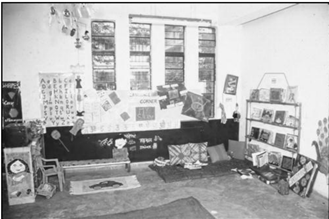
Figure 1 Mrs Shanta's class library.

I placed a mat in the library corner because most of the students found it more comfortable to read while sitting on the floor. I obtained some attractive posters, free from book sellers, to encourage reading. A chair provided a place for me or one of the students to read aloud to the other students (Figure 1).