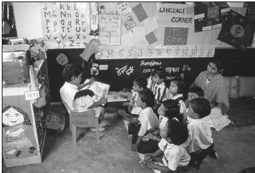
Figure 3 A student reads a story to other students and the teacher.

Then invite a student to read the story to the rest of the class (Figure 3). Let the student hold the book and pretend to be the teacher. The student may have memorised some or all of the text, but this is fine – let the student imitate the way you read with expression and enthusiasm. Sit with the other students and show them how to be a good listener. Join in if there are choral parts to the reading.