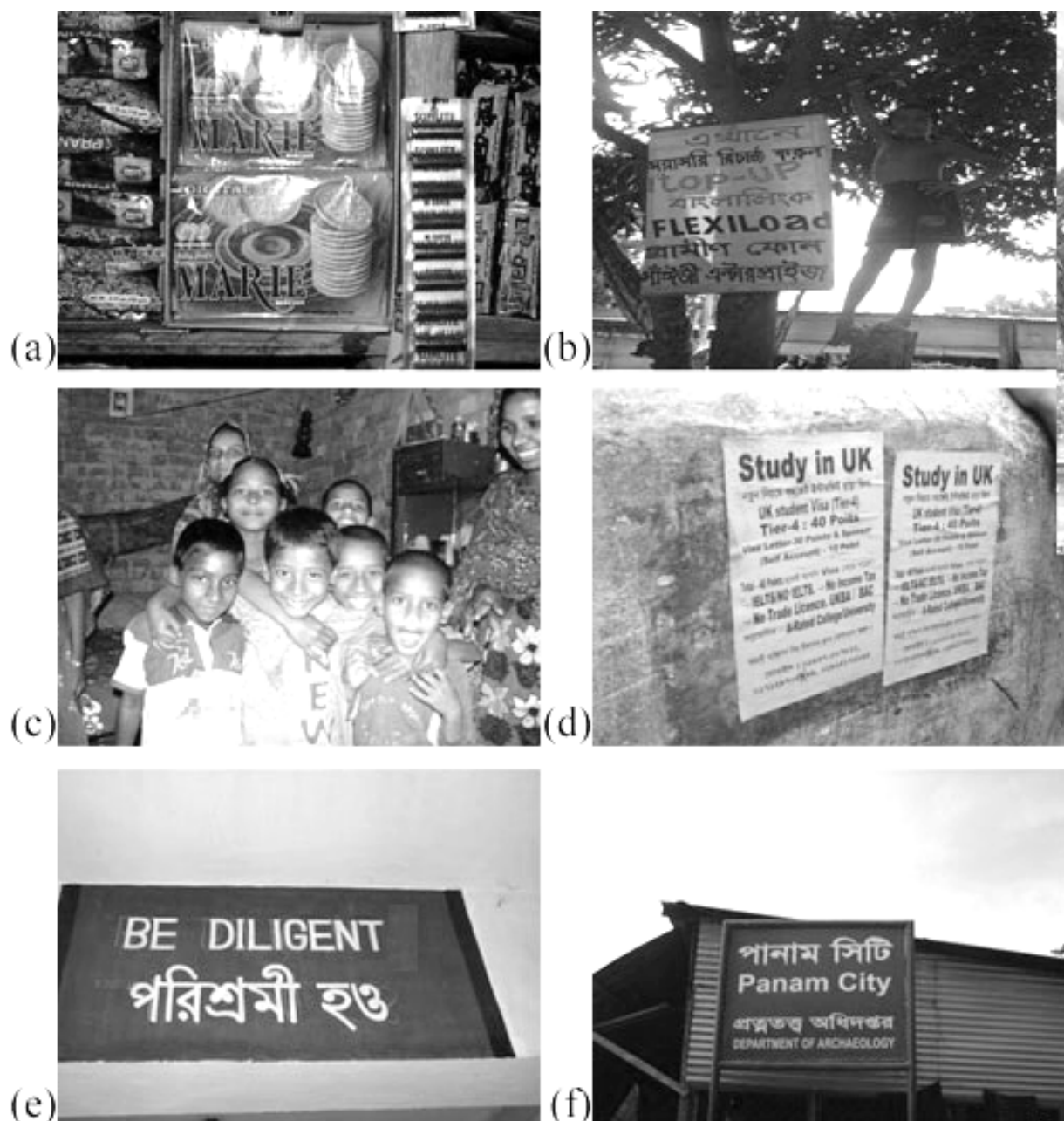
Figure 1 Examples of English in the community: (a) on packaging; (b) in an advert for mobile phone services; (c) on children's T-shirts; (d) in an advertisement on a village wall; (e) on a bilingual sign in a school; (f) on a street sign.

Once you have made your list, review it and think about whether your students will also be likely to encounter English in these places. Will they be familiar with the language? Are some of the words and phrases that you teach in your language lessons also present in the local environment? Can you draw on some of the examples that you have collected and use them in your classes?