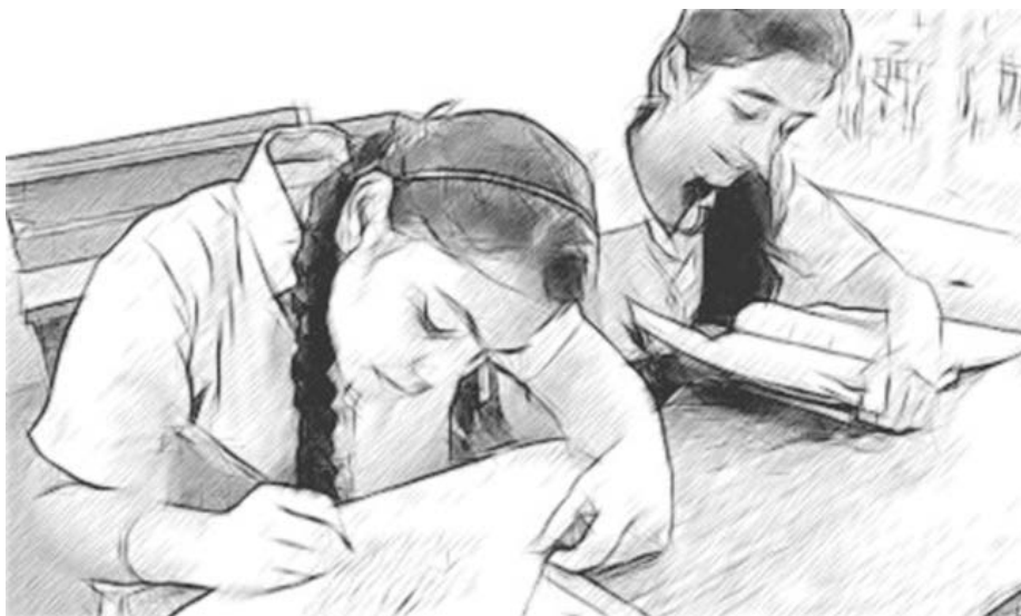
Figure 2 One student dictates 'The Raincoat' while the other one writes down what their partner reads.

I made sure that everyone understood the instructions by getting them to say what they needed to do in their home language. I told my students, 'You have ten minutes for the pair dictation.' The Student As began to dictate the passage to their partners [Figure 2]. As they did the activity, I walked around the classroom, listening to the pairs and checking that everyone was doing the activity correctly. Some of them were still not sure, so I explained again. Most of them were enjoying the activity and it was working well. It was good to hear so many of my students speaking in English.