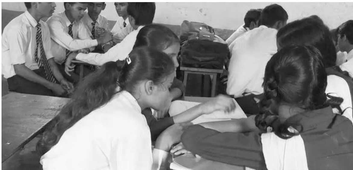
Figure 3 Interviews in small groups.

Students started the interviews [Figure 3]. I moved to the back of the room to listen to a group. As I listened, I noticed that one girl was not participating – her classmate was answering all of the questions. I told them that they must take it in turns to answer questions, and that her classmate could help her with words when she was stuck.