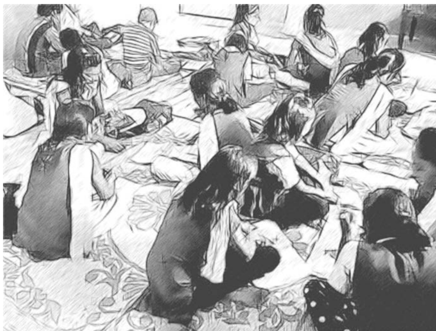
Figure 1 Students working together in pairs and groups to practise speaking English. Note that by working simultaneously, all the students have an opportunity to speak.

You may be thinking that it is difficult to give all your students the opportunity to speak in class, especially if you have a large number of students. One way that you can give all of your students the chance to speak is by organising them into pairs or small groups (for example, of three or four students) to talk with each other (Figure 1).