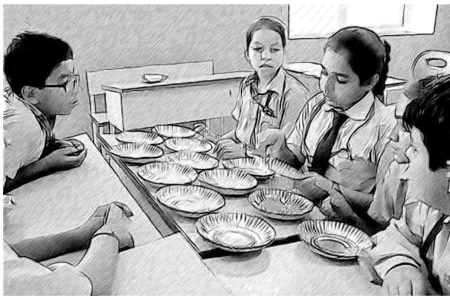
Figure 1 A group of students using plates to learn about fractions.

Now move on to problems that mix the two ideas.