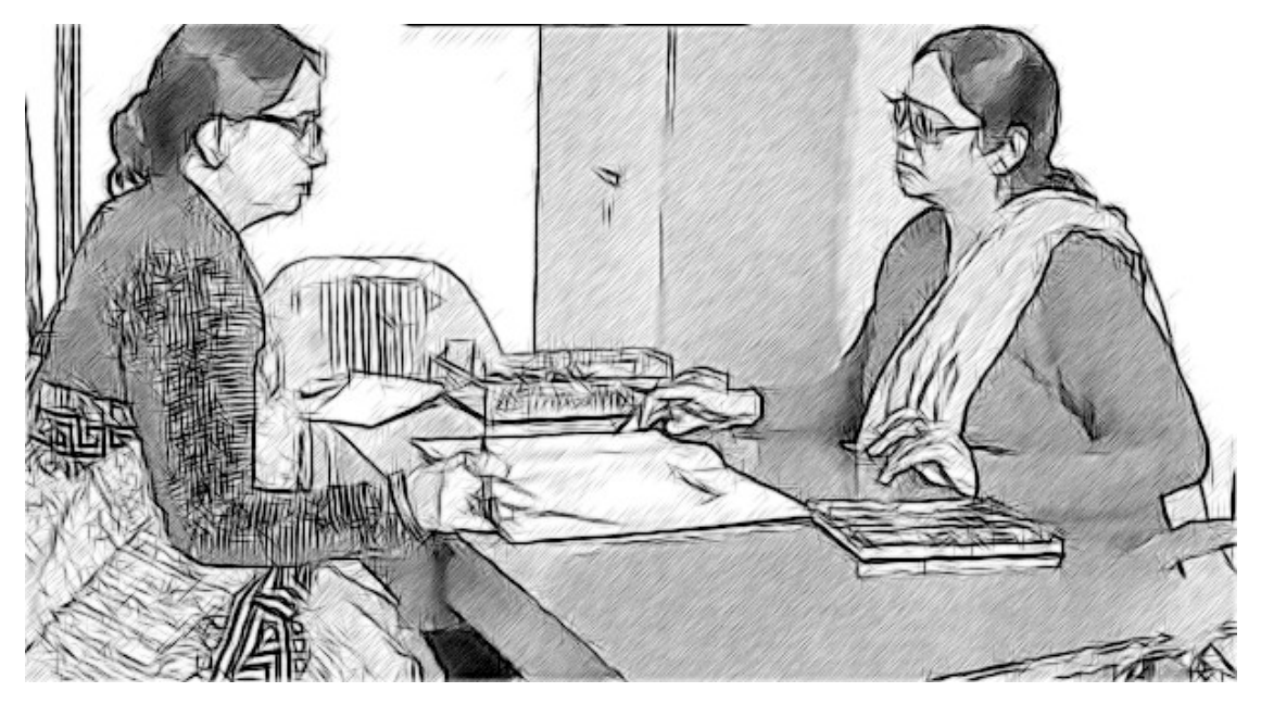
Figure 1 As a school leader you need to be aware of the state's schemes and plans so that you can plan how to utilise them for the benefit of your school and students.

It is likely that the state will have various initiatives and schemes to address these responsibilities, for example a three-year programme to put perimeter fences around each elementary school, a recruitment drive to fill 50,000 teacher vacancies, mobile vans with specialist services for students with learning disabilities, or a roll-out plan for instituting a technology infrastructure across the state.