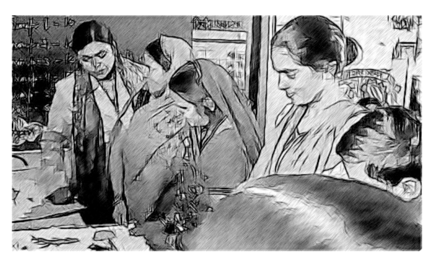
Figure 5 It is important to engage with your students' parents.

While these are not all the ways in which parents could be involved in their child's school, the audit may give you some ideas about how to improve. If you total up your scores, you will end up with a percentage score as to how far you engage parents in your school.