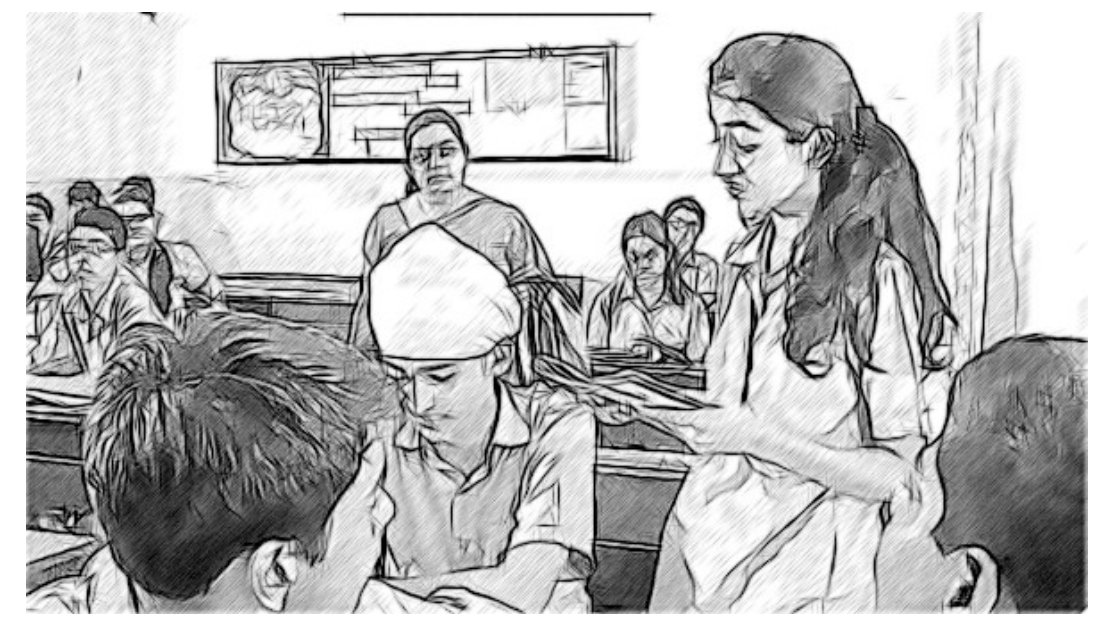
Figure 3 Telling the story of a field visit.

The Class IX students were taken to a science activity centre run by a foundation for several days. One of the students wrote an account for the school blog (Mehta, 2014), which you can read below.