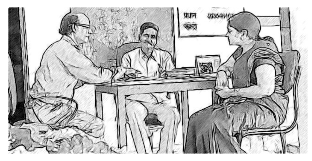
Figure 3 Delegating work to colleagues.