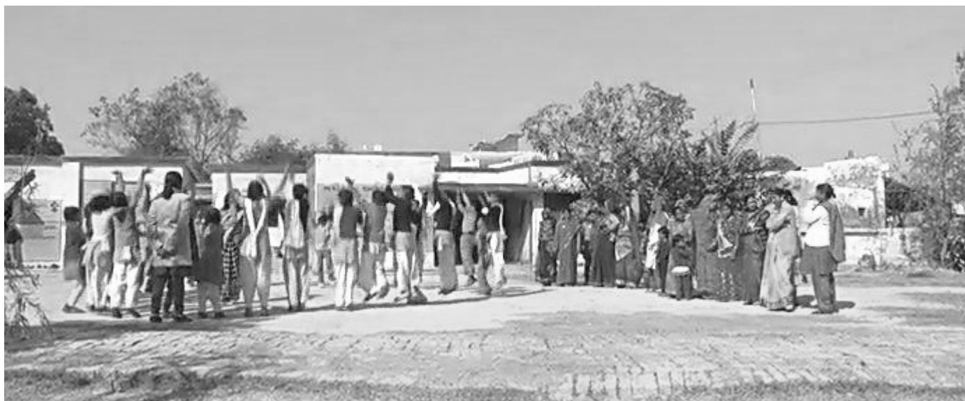
Figure 1 Promoting inclusion in your school.