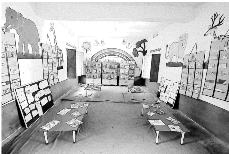
Figure 3 A classroom reading corner.

It is important to involve students in the design and resourcing of a classroom reading corner. In this way they will want to use and improve it.