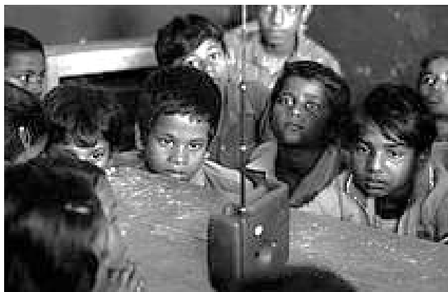
Figure 4 Listening to the radio in the classroom.

It is helpful to practise exploiting radio programmes for language and literacy development before you try using them in class.