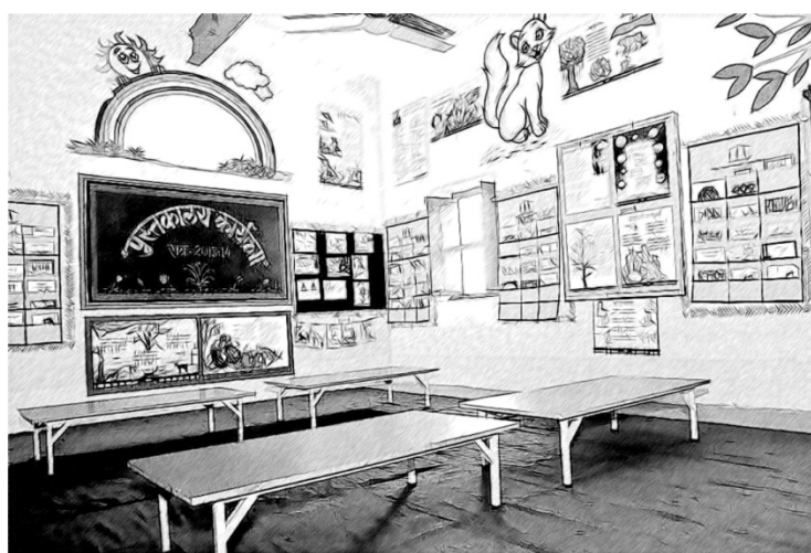
Figure 2 An example of a language-rich classroom.

In one part of the classroom, I have created a word wall. This is where I post up the new words that my students have encountered during the week. I also encourage my students to write these words up themselves.