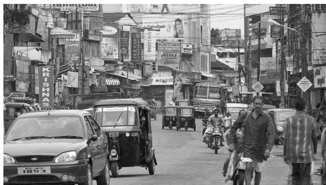
Figure 1 Street showing the ubiquity of environmental print.