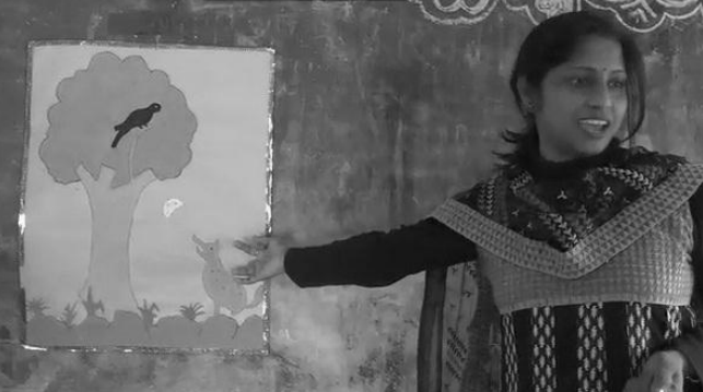
Figure 1 Using stories in the classroom.