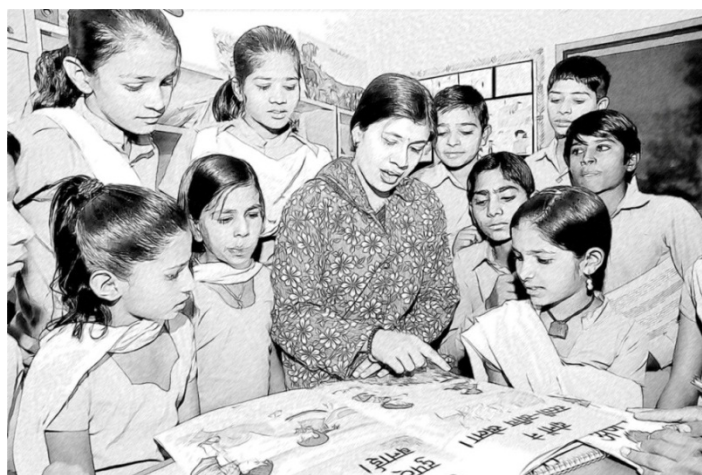
Figure 1 Talking about a book in the classroom.

Plan a short book talk session in your classroom. It should last no more than 30 minutes.