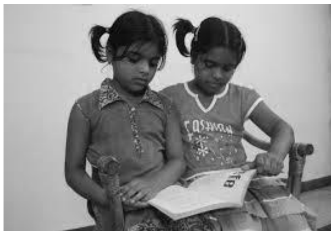
Figure 3 Paired reading.

With paired reading, two students share a book and take turns to read a sentence, paragraph, or page (Figure 3). The first reader reads while the second reader listens and follows along. The second reader then continues from where the first reader stops. If one of them is struggling or makes an error, their partner can support or correct them.