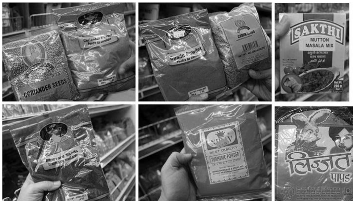
Figure 1 Examples of writing on food packaging.

I brought the packaging into class and selected one to show one to my students. It was a mango drink carton. Several of my students recognised it as they drink it themselves.