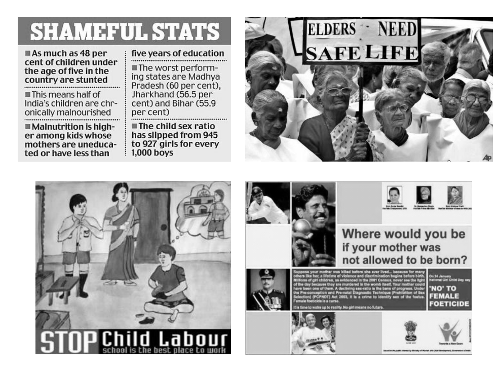
Figure 3 Sources of information: a newspaper (top left), local people (top right) and posters (bottom left and right).

Note down all the sources of information that they propose on the blackboard. These might include school textbooks, a library, a newspaper, the Internet, a health centre, posters, leaflets, a local government office or local people.