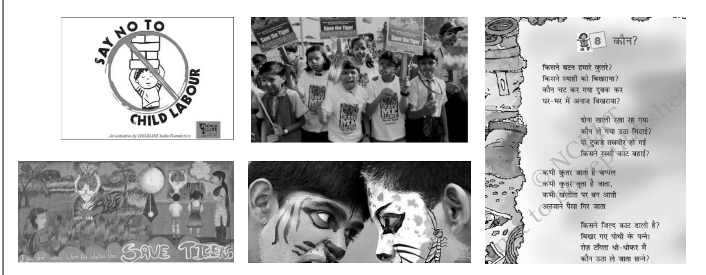
Figure 4 Different ways of presenting your students' learning: a poster (top left), community action (top middle), written text (right), artwork (bottom left) and a performance (bottom middle).

There are many ways that students can present and share their learning over the course of the project. Whether undertaken individually or collaboratively, this might take the form of a written report, a poster, artwork, a performance, songs, stories and poems, or community action.