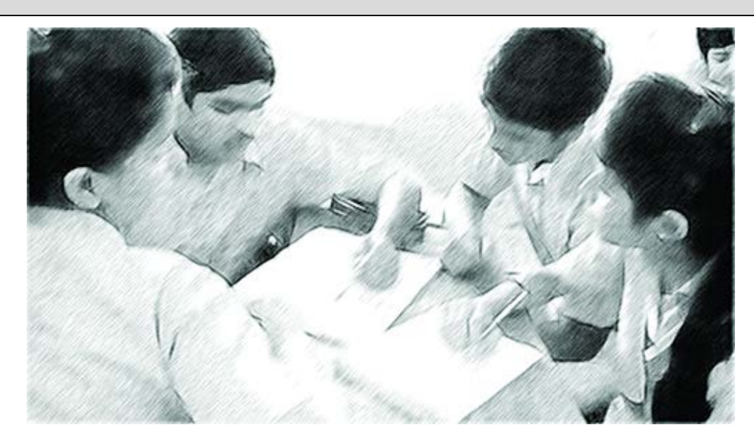
Figure 3 Even if your classroom has desks that are fixed in rows, your students can work in groups.

Think about what you have to teach in the next few weeks. Use the textbook to help you identify a relevant environmental or social issue. Some examples are given in Resource 2.