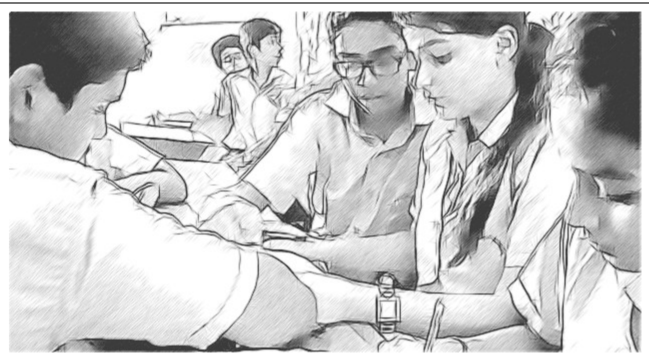
Figure 1 When students are working in a group, it is a good idea to assign roles. In this picture the group leader is working out who will be the scribe, who will collect and set up the apparatus and who will conduct the experiment.

The last point should allow students to find out that increasing the volume displaced (by putting the stone into a dish) increases the apparent weight loss. The upthrust is greater as more water is displaced.