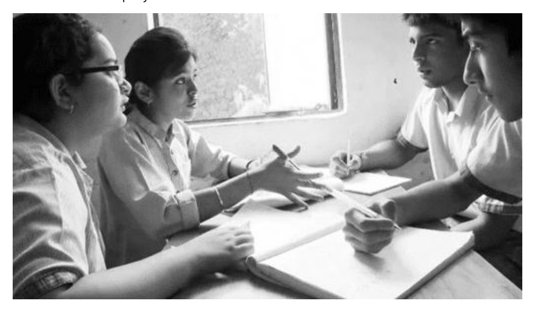
Figure 1 Students working on a shared project.

to complete. But ultimately, you need to decide the group size based on your class size, the resources available and the nature of the project.