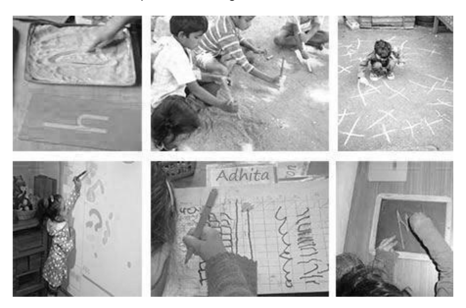
Figure 2 Examples of where students can write: in sand with fingers;

Look at Figure 2. Which of the activities would be possible to do with your students in your classroom and school? Discuss this with a fellow teacher if possible. Think of the spaces in your classroom, and outside your classroom, where students could practise writing.