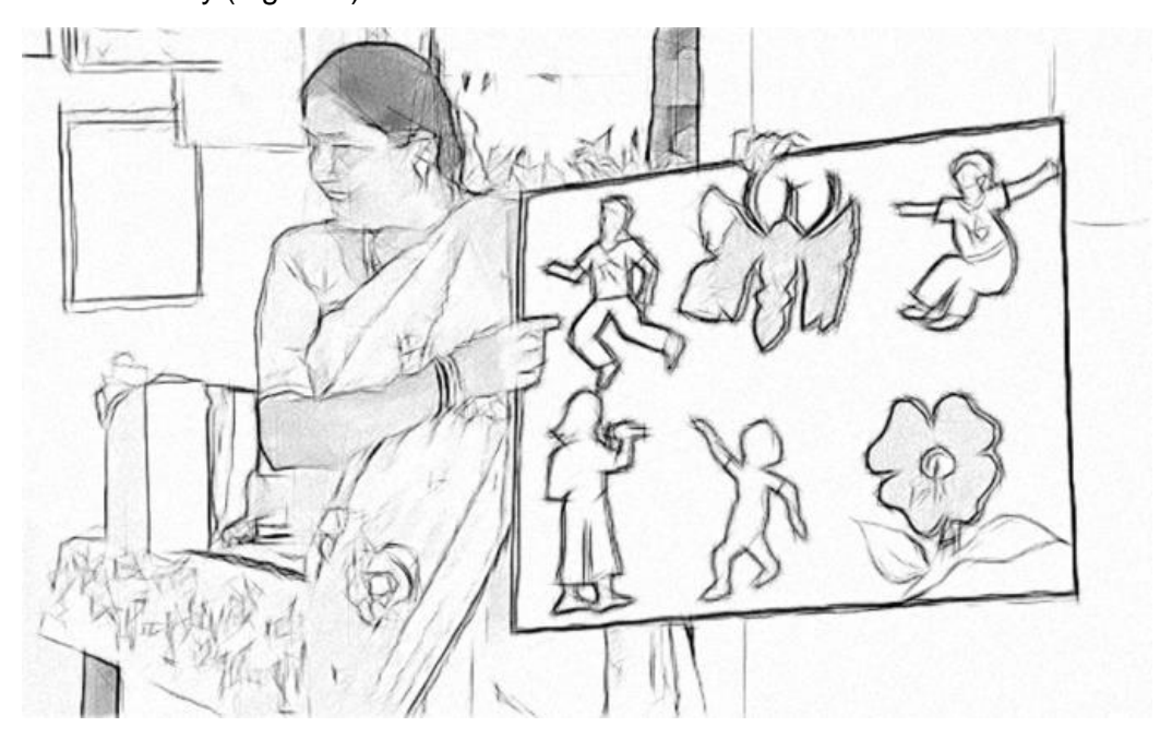
Figure 2 Using pictures to tell a story.

prepare pictures for a story (Figure 2).