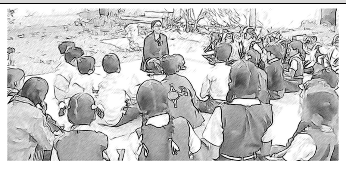
A teacher tells a story without referring to the text.

To gather the class together and prepare students to listen to a story, you can ring a story time bell or beat a story time drum. You can say a rhyme or sing a version of 'If You're Happy and You Know It':