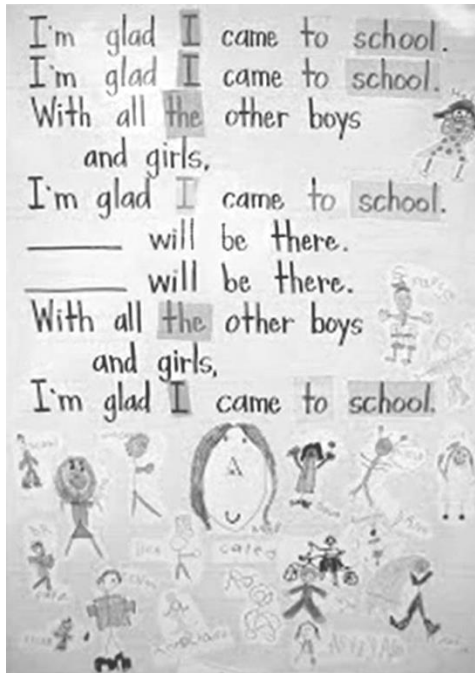
Figure 1 A shared reading poem.

Look at the poem in Figure 1, written out on a large piece of paper. It was created by a teacher for Class II students. Read it aloud.