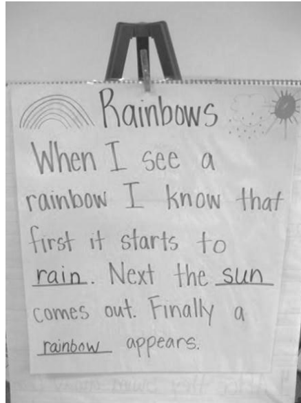
Figure 2 Shared reading using the subject of rainbows.

You can make a shared reading text on any subject, such as parts of the body, numbers, a history or geography topic, or the words of a song. See the hand-made example in Figure 2.