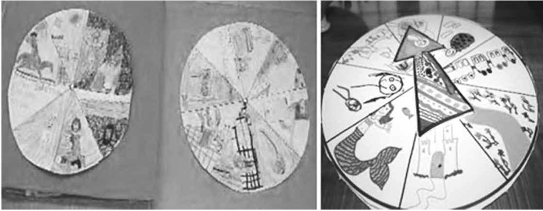
Figure R3.3 Examples of story wheels.