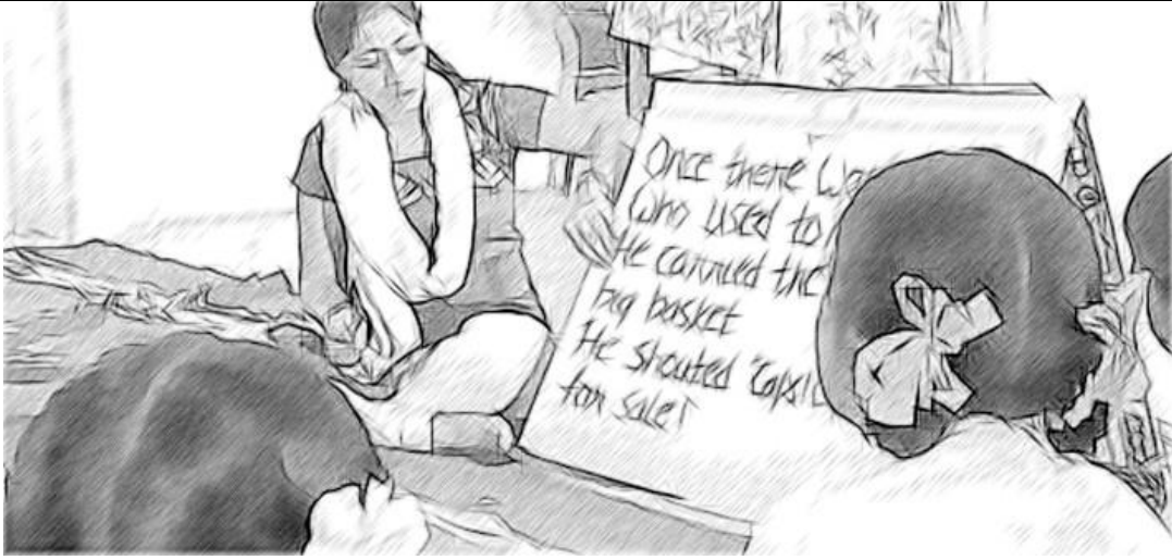
Figure 3 A teacher has used cardboard to make a stand for the big book.