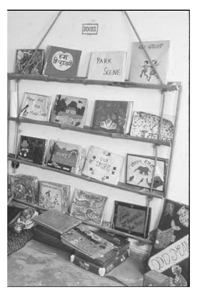
Figure 2 An example of a class book area.

Talk to other teachers about how you could work together to create shared resources for reading.