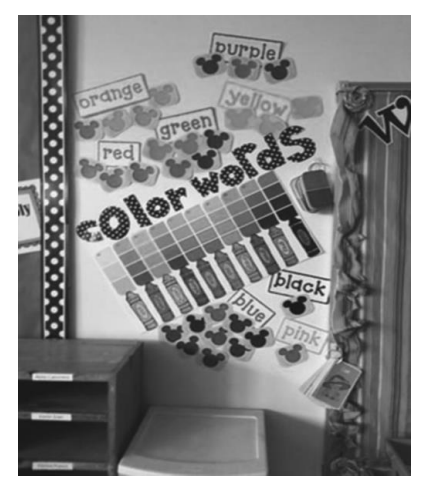
Language in art and craft lessons.