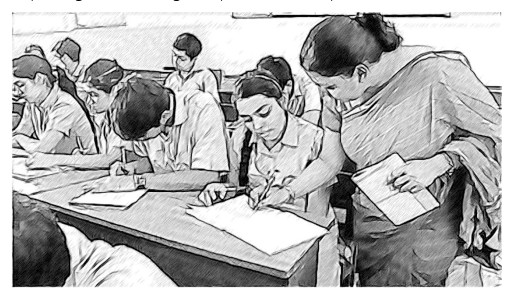
Figure 2 Walking around the class and encouraging students will help them to improve their use of English.

There was a buzz in the class as students discussed their ideas with each other, and with me. They also looked up words in the class dictionary. While they were working, I moved around the class, checking what was happening, and helping students where they needed it. I also encouraged students to use English in their discussions, speaking to them in English myself as much as possible.