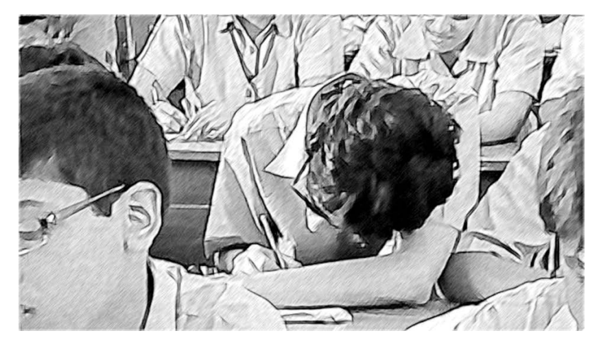
Figure 1 Writing in another language is difficult, but you can help your students to develop effective writing practices.

You can help your students to develop the skills of effective writing. This will help them to write better English compositions that have the ideas logically organised, are interesting to read and are more accurate. These skills will also be useful for writing in other languages. The process of organising ideas, reviewing work and writing drafts will make them more effective writers in general.