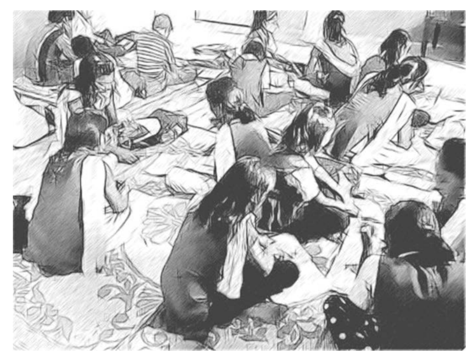
Figure 1 Students working together in pairs and groups to practise speaking English. Note that by working simultaneously, all the students have an opportunity to speak.

You may be thinking that it is difficult to give all your students the opportunity to speak in class, especially if you have a large number of students. One way that you can give all of your students the chance to speak is by organising them into pairs or small groups (for example, of three or four students) to talk with each other (Figure 1).