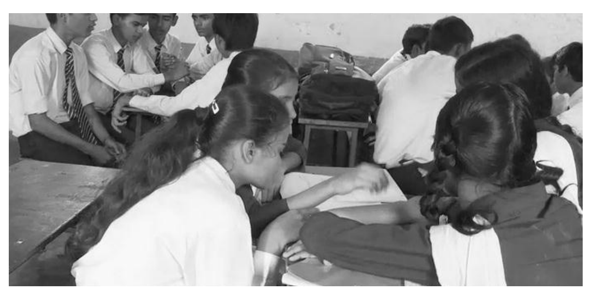
Figure 3 Interviews in small groups.

Students started the interviews [Figure 3]. I moved to the back of the room to listen to a group. As I listened, I noticed that one girl was not participating – her classmate was answering all of the questions. I told them that they must take it in turns to answer questions, and that her classmate could help her with words when she was stuck.