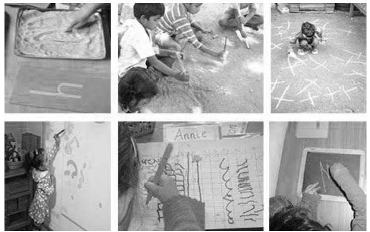
Figure 2 Examples of where students can write: in sand with fingers; outside with sticks; on the pavement with chalk; on the wall with paint; on recycled paper with pens; and on boards with chalk.

Look at Figure 2. Which of the activities would be possible to do with your students in your classroom and school? Discuss this with a fellow teacher if possible. Think of the spaces in your classroom, and outside your classroom, where students could practice writing.