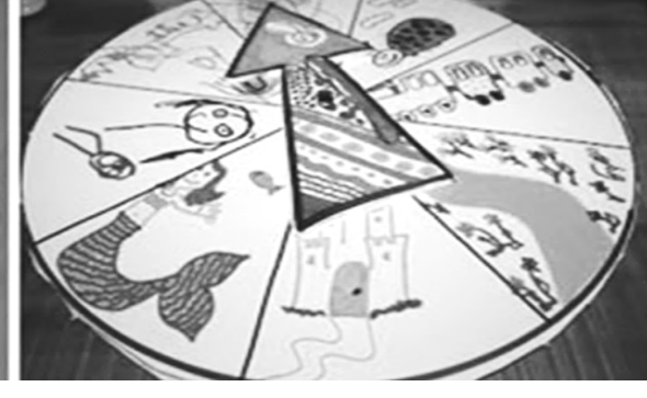
Figure R3.3 Examples of story wheels.