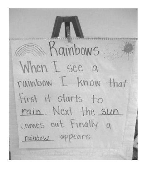
Figure 2 Shared reading using the subject of rainbows.

You can make a shared reading text on any subject, such as parts of the body, numbers, a history or geography topic, or the words of a song. See the hand-made example in Figure 2. Figure