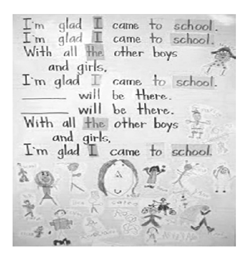
Figure 1 A shared reading poem.

Look at the poem in Figure 1, written out on a large piece of paper. It was created by a teacher for Class II Students. Read it aloud.