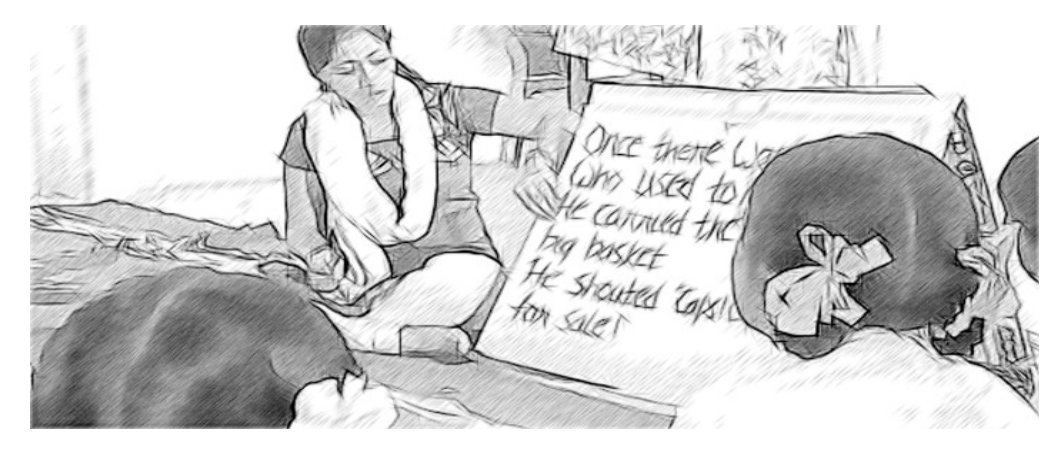
Figure 3 A teacher has used cardboard to make a stand for the big book.

Look at the teacher with her students in Figure 3. She has made a simple stand for the big book out of cardboard.