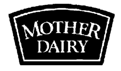
Figure 1 Mother Dairy logo.

Start by looking at the term 'environmental print', its meaning and how it can support students' learning. Environmental print is often the first writing that students learn to read with enjoyment and enthusiasm. For instance, many students will know that the words in Figure 1, on a blue background, and this shape, mean a nice treat of ice cream. Can you think of other signs like this?