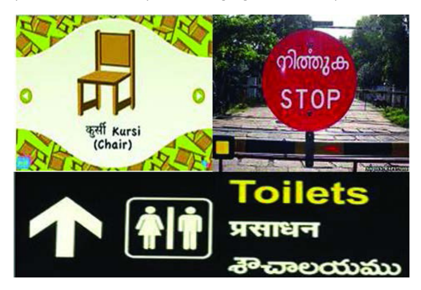
Figure 2 Three signs.

Look at Figure 2. Think about how the words and images work together, and the colours you also might see with the words and shapes. If you could not read any written language, how would you know what these signs say?