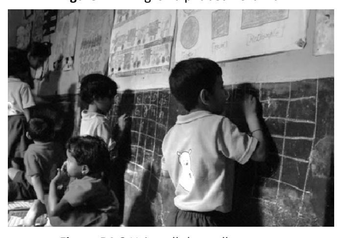
Figure R1.3 Using all the wall spaces.