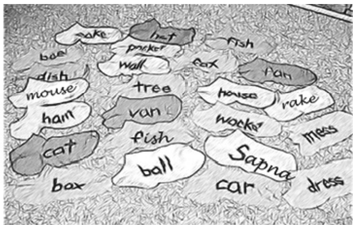
Figure 3 The importance of context.