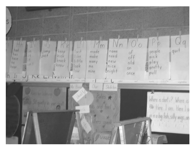
Figure R1.1 Using chart paper, string and pegs.

Look at Figures R1.1–1.3 and think about what is possible in your classroom.