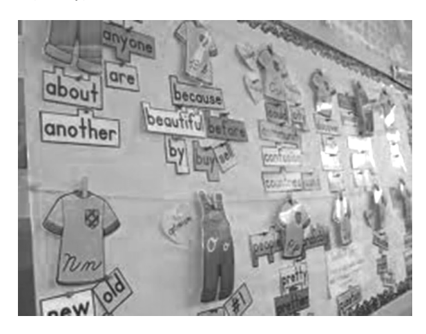
Figure R1.5 A word wall about a story and its characters

A literature word wall can also have pictorial descriptions of the story's main plot or its characters (Figure R1.5). These pictures can be associated with one line about the story, the characters' names or anything related to the story that is significant and memorable. A word wall that displays words from a particular story should also include the names of the author, illustrator and translator (if any).