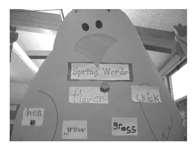
Figure R1.6 A seasonal word wall.

Elementary grade classrooms study units around the seasons of the year. Thus, 'seasons' can be used as a context to develop a word wall (Figure R1.6). Important key words focusing on a particular season can be used to create a seasonal word wall.