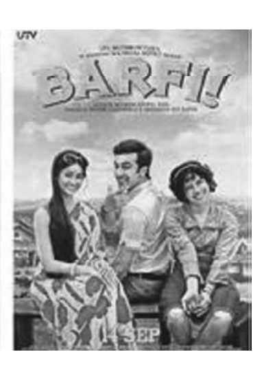
Figure 4 Examples of print materials.

With these resources, we began to build the classroom's print environment.