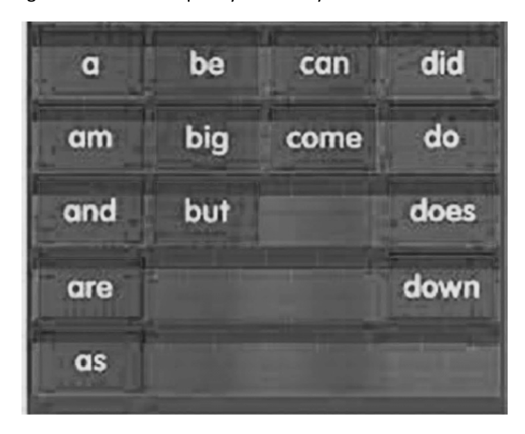
Figure R1.4 A chart for changing high-frequency words

Primary grade texts are comprised primarily of high-frequency words – these are words that occur often in conversation or in books. (Examples are shown in Figure R1.4.) Students learning English can get a boost in their language skills when they recognize these words quickly and easily.