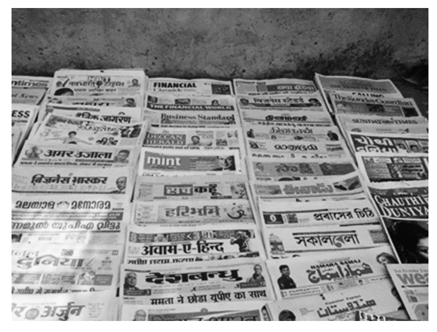
Figure 2 You can also use news stories to teach English in your classroom.