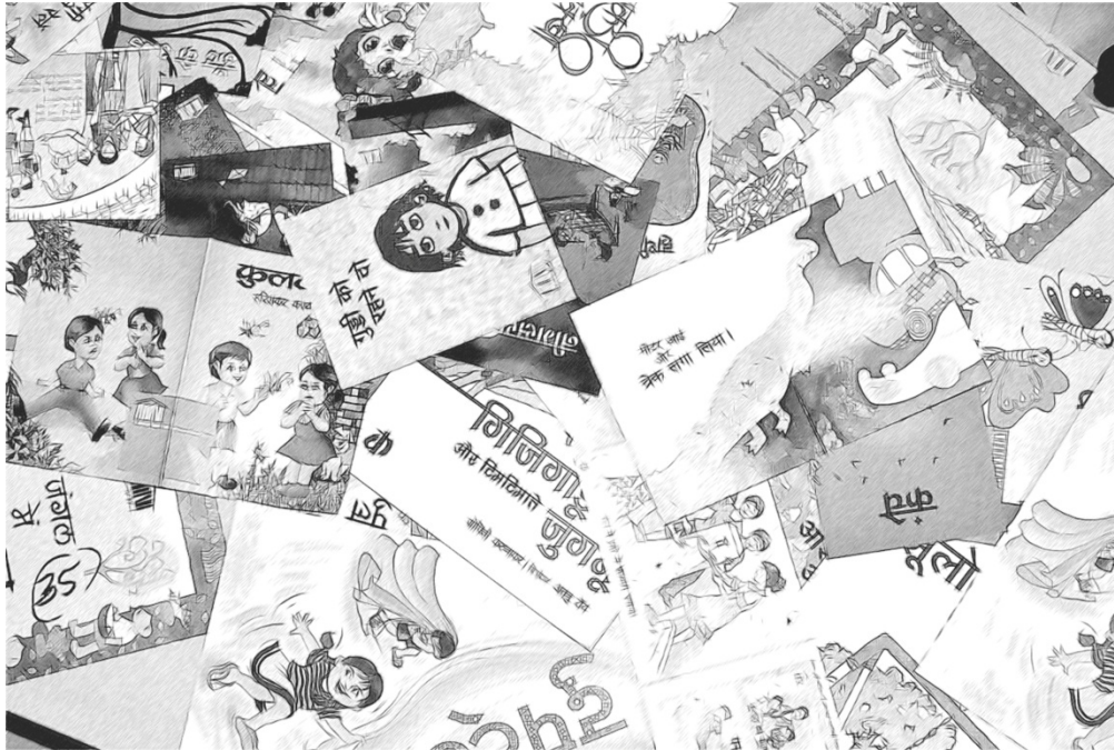
Figure 2 A variety of reading materials in the reading corner.

Start a collection of books, magazines, leaflets and other reading materials in the languages that your students speak and add these items to your reading corner (Figure 2).