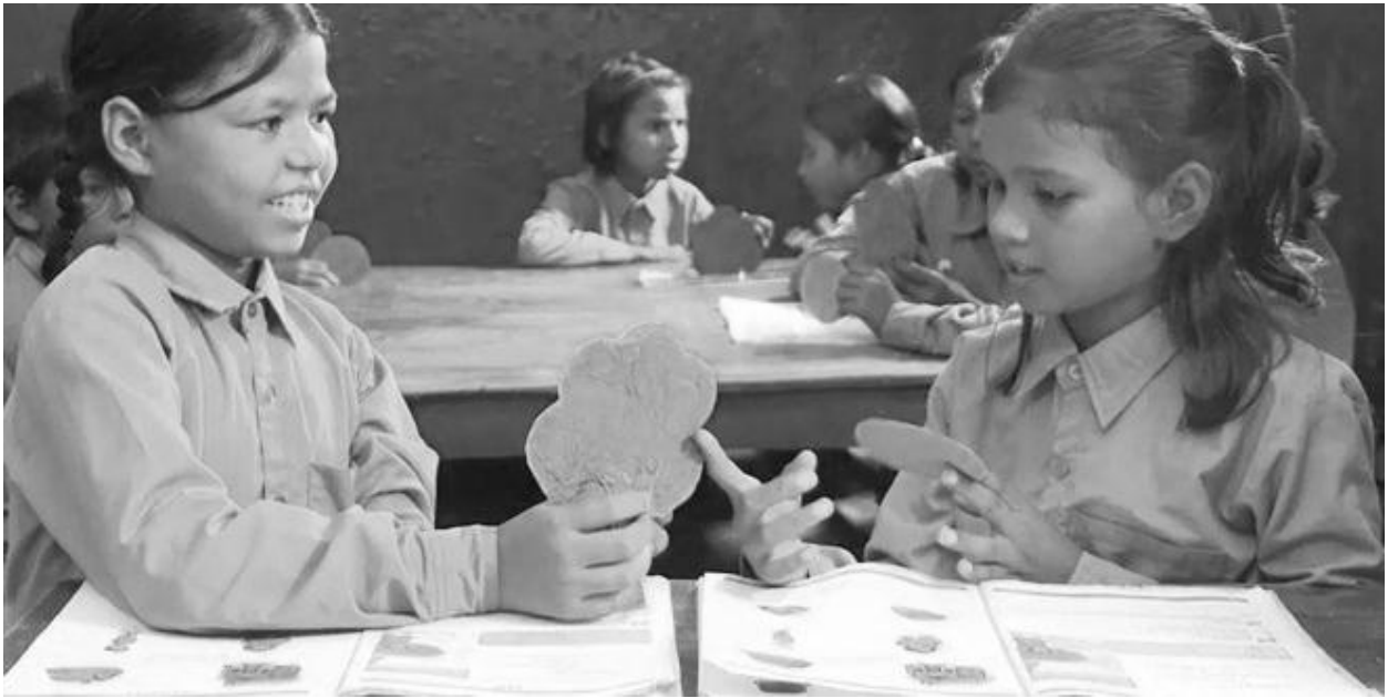
Figure 3 Students discuss a topic in pairs using their home language.

Recently I located a traditional short story that was available in Hindi and my students' home language. I used this with my Class VII students. I made copies of the stories in each language and got small groups of students to read them in parallel. I then invited them to use their home language to compare the different versions of the two stories, including the key words that had been used in each.