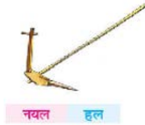
Figure 1 A plough. Which letter of the alphabet does it represent in your students' home language?

I knew that I needed to help my students to learn the names and sounds of the Hindi letters correctly, so I made an alphabet chart using words from the Ho language. In this way, they could learn the letter-sound correspondences of the Hindi alphabet more easily. I then helped them to learn the Hindi illustrative words as well. This helped them build up their Hindi vocabulary too.