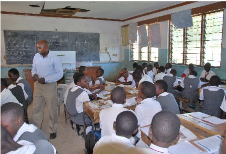
Figure 1 An inclusive classroom.