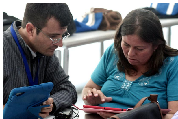
Working Together by Alan Levine is licensed CC BY 2.0

In early 2024 there were an estimated 9000 energy communities across Europe. [ Source ]